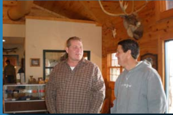
Members and guests take the time to get to know each other before the shoot begins.