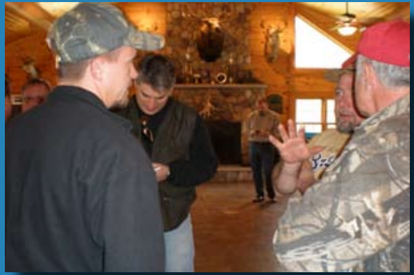
Members and guests chat before the shoot begins